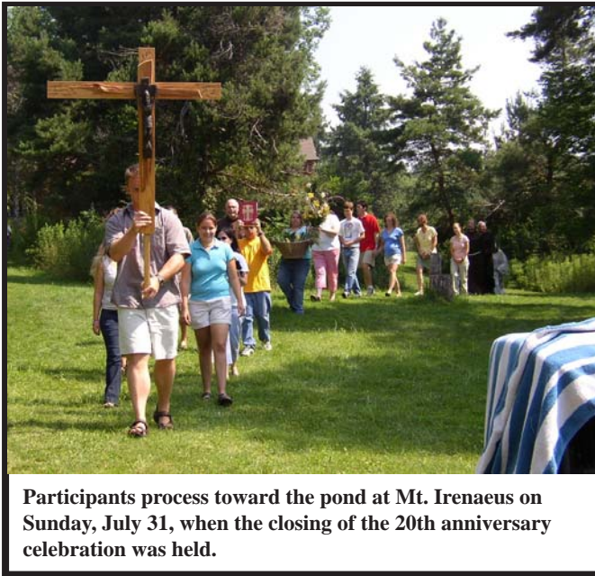
Participants process toward the pond at Mt. Irenaeus on Sunday, July 31, when the closing of the 20th anniversary celebration was held.